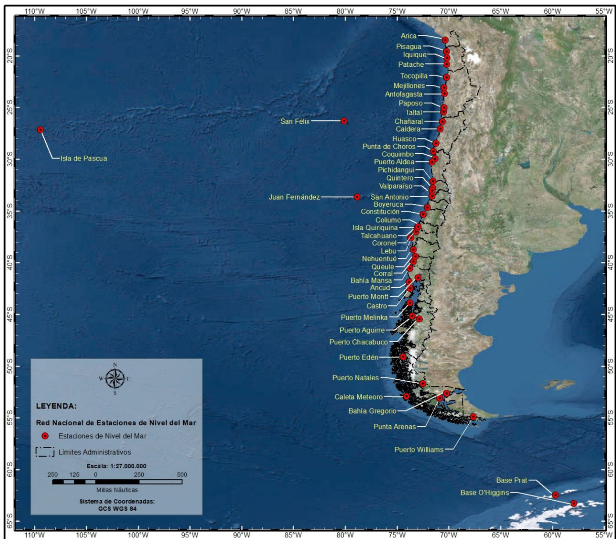
Figure 1 : Chilean Sea Level Network

The data collected at the Chilean Sea Level Network are available through the website developed and maintained by VLIZ for UNESCO/IOC. Additionally, data can be accessed in real time through SHOA's website through the link: http://www.shoa.cl/ and through the GOOS Regional Alliance for the South Pacific (GRASP) portal website "Regional Network Sea Level Stations", making use of the website developed and maintained by the Oceanographic and Antarctic Institute of the Ecuadorian Navy (INOCAR) https://coos.inocar.mil.ec/visores/red_mareografica/ .