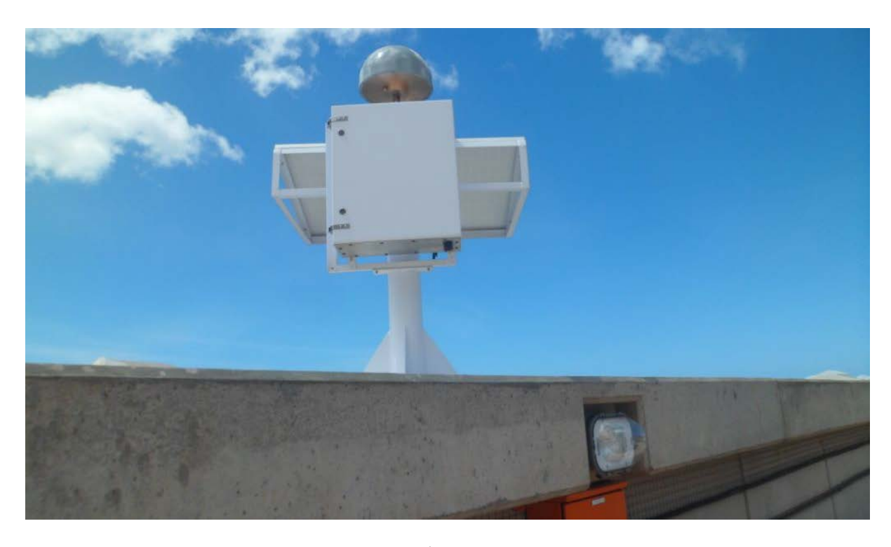
Rupert's Bay GNSS