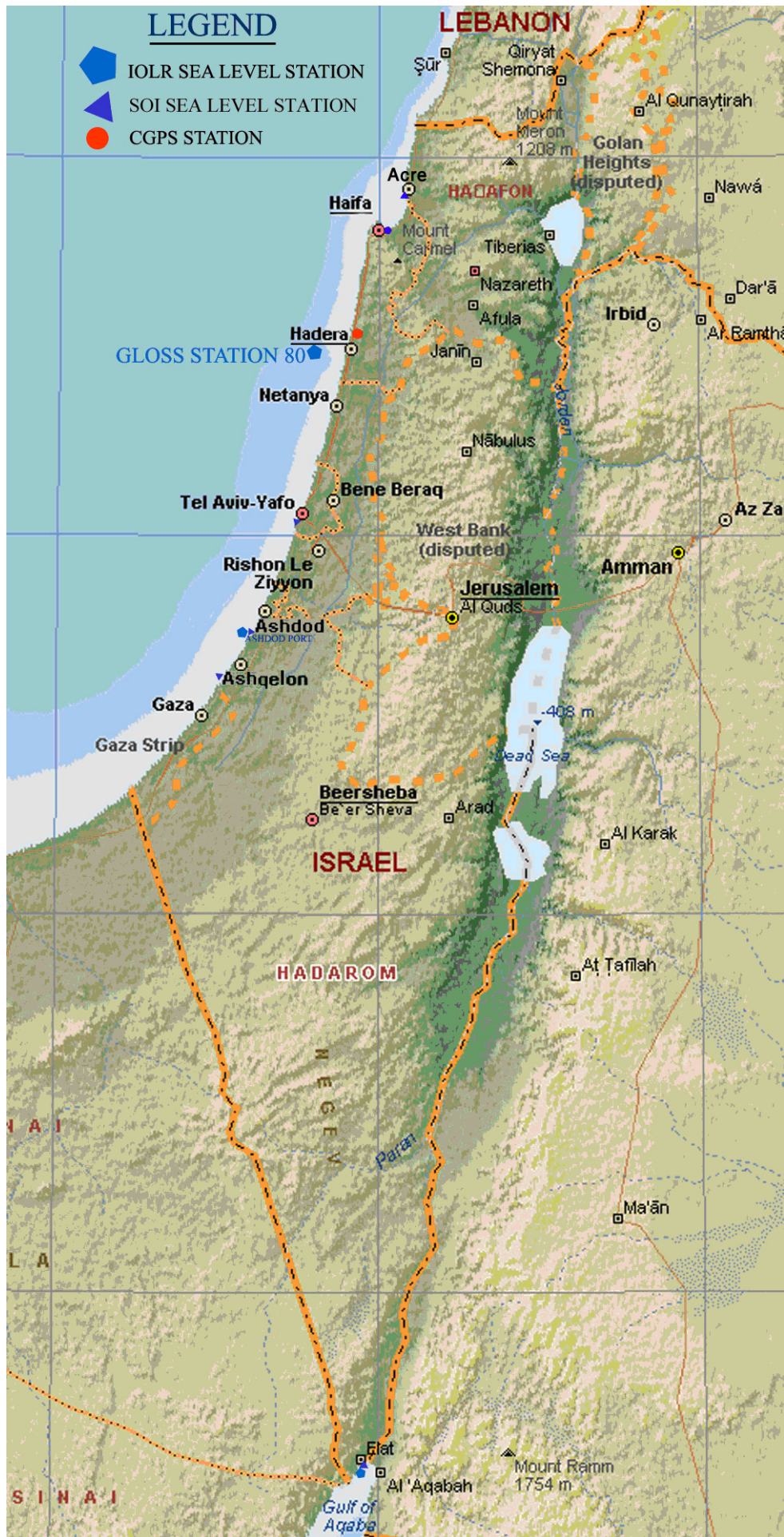
Figure 2 – Location map of present Sea level monitoring stations in Israel