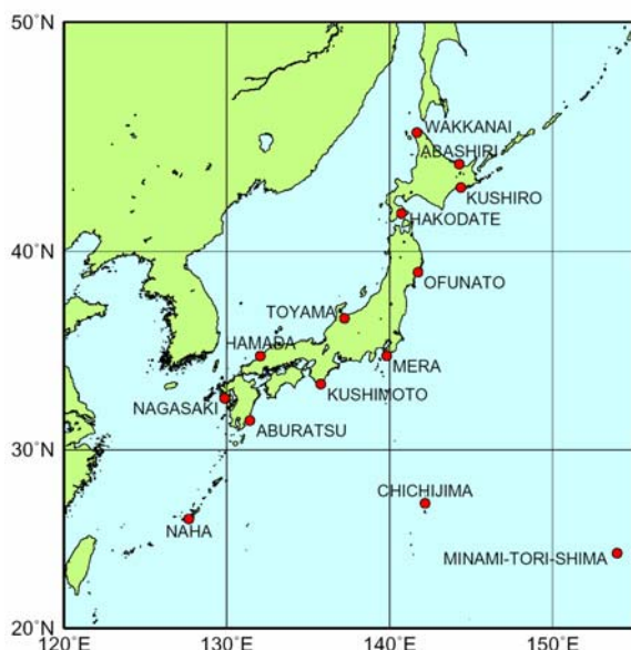
Fig.1: Tide stations around Japan registered in GCN

In Japan, tide stations are operated by several national and local governmental organizations including JMA, Japan Coast Guard (JCG) and Geographical Survey Institute (GSI). These three organizations run 66, 30 (including Syowa station in the Antarctic) and 25 tide stations, respectively. Among the stations, fourteen stations of JMA and Syowa station are registered at the GLOSS Core Network (GCN, see Fig.1 and Table1).