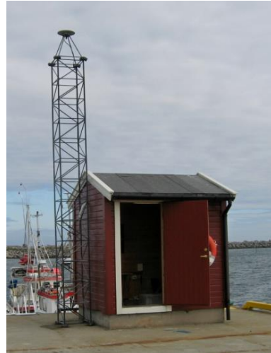
Figur 2: Tide gauges with continuous GNSS receivers at Tregde (to the left) and at Andenes