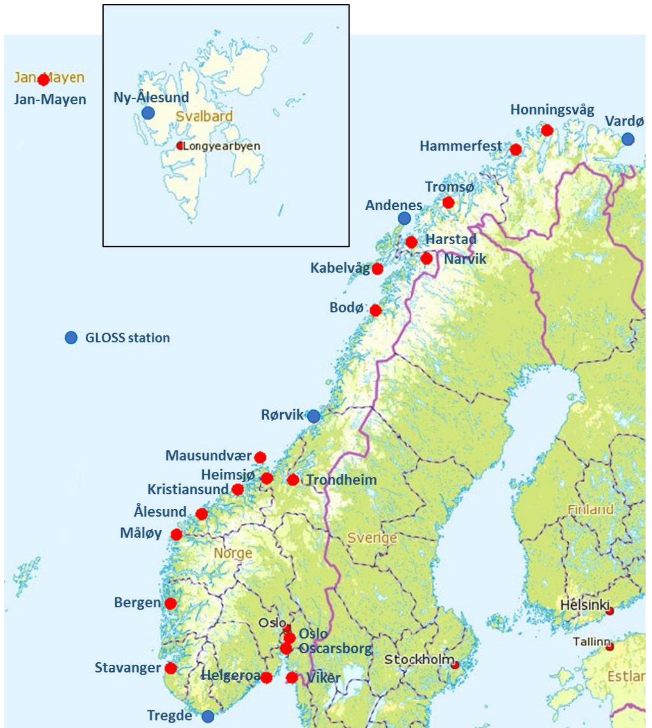
Figure 1 The Norwegian Tide Gauge Network, May 2017.