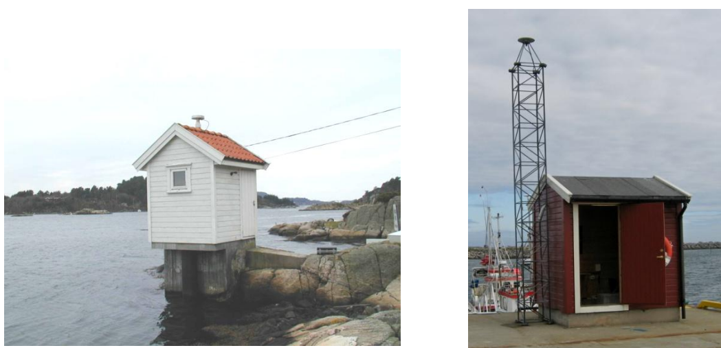
Figure 2: Tide gauges with continuous GNSS receivers at Tregde (to the left) and at Andenes

The Norwegian Mapping Authority, Geodetic Institute is responsible for the continuous GNSS measurements and analyses of the data.