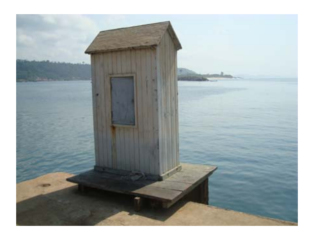
Tide gauge housing at San Pedro

The Ivorian network is based on the old stilling well gauge technology (AOTT). It becomes difficult to find spares for the maintenance of such equipment now.