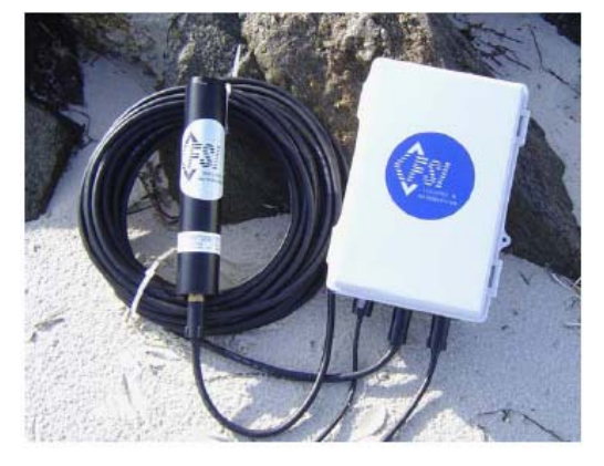
Components of the EOPM tide recorder