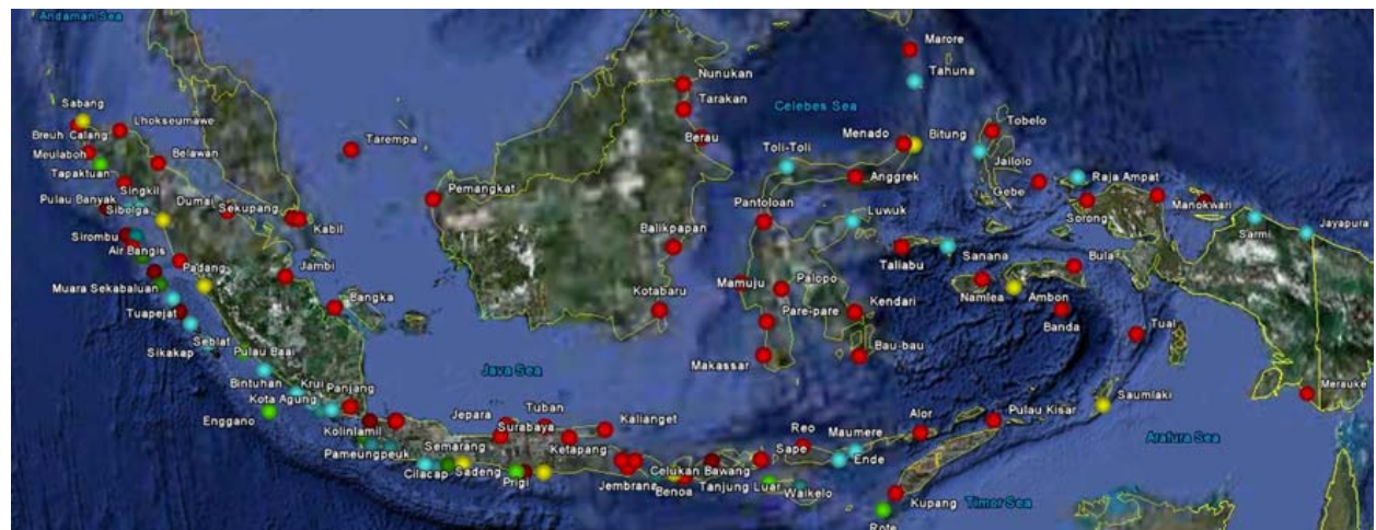
Figure 1. Recent Status of Indonesia Sea Level Monitoring Network, purely financed by Indoesian Government (Red), in cooperation with USA (yellow), with Germany (Cyan)

Since 1984, National Coordinating Agency for Surveys and Mapping of Indonesia (BAKOSURTANAL) has been developing and operating the National Permanent Sea Level Monitoring Network. Initially, the equipments were developed using graphic/analog system and it is intended to support the determination of vertical datum for surveying and mapping purposes, navigation and coastal management that do not require data in real time. The number of tide gauges is increased from year to year in line with the increasing needs of reference vertical datum for levelling networks to support surveying and mapping activities. The early implementation was started by BAKOSURTANAL with 8 analogue stations. The number of new stations increased by about 2 per year, except for a significant increase of 25 digital stations in 1998 to support the bathymetric mapping of the Exclusive Economic Zone (EEZ) and Sea Line Passages in Indonesian waters. The Indonesian Sea Level Monitoring Network before the 2004 Sumatra Tsunami consisted of 60 stations, of which 35 stations were using analogue graphical chart recorders and 25 stations were using digital recorders with Public Switch Telephone Node (PSTN) data connection.