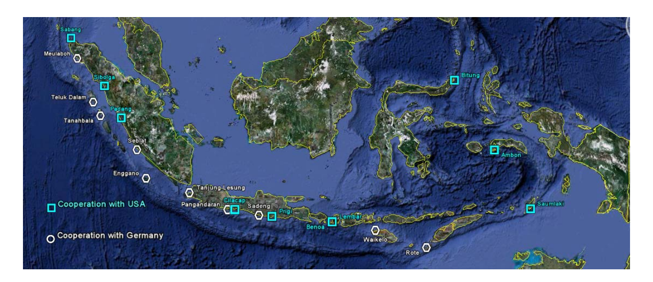
Figure 3. Distribution of German-Indonesia (GITEWS) and USA-Indonesia Sea Level Monitoring

GTS/Meteosat. Later, BGAN communication capability will be added to the stations. The data can be accessed via <a href="http://www.ioc-sealevelmonitoring.org/">http://www.ioc-sealevelmonitoring.org/</a>, see figure 4.