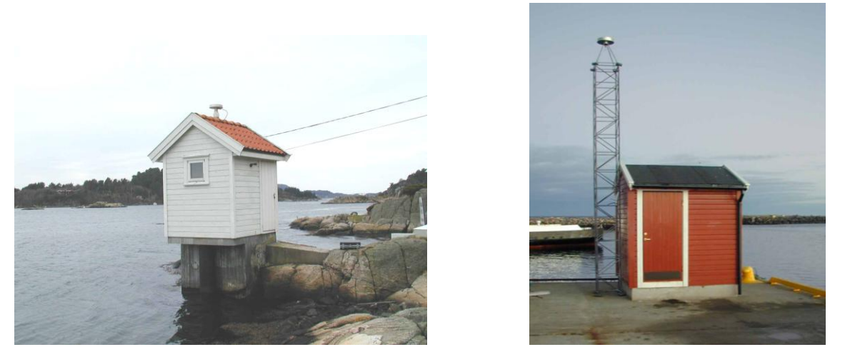
Figure 2. Tide gauges with continuous GNSS receivers at Tregde (to the left) and at Andenes.

The Norwegian Mapping Authority, Geodetic Institute is responsible for the continuous GNSS measurements and analyses of the data.