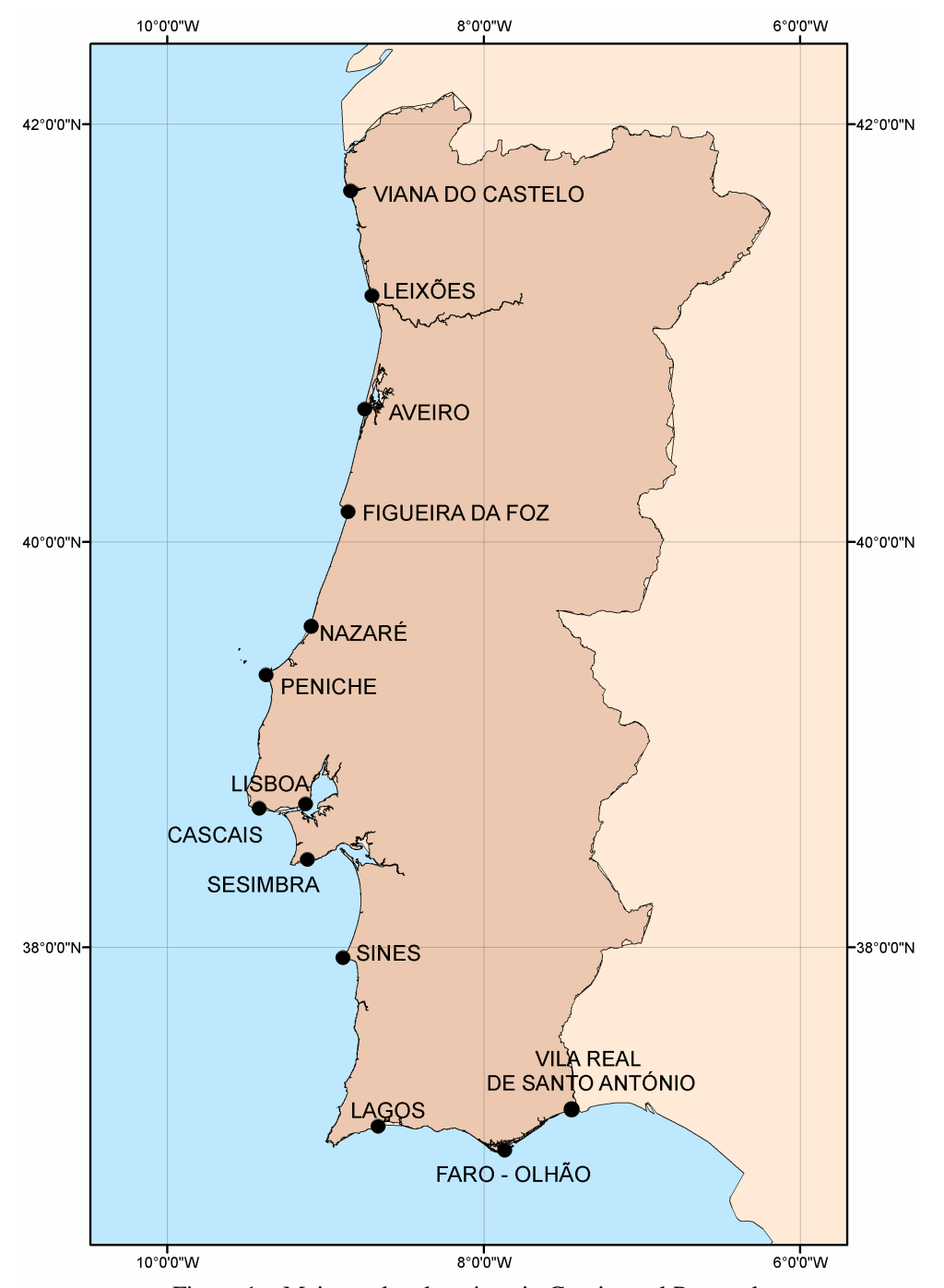
Figura 1 – Main sea level stations in Continental Portugal