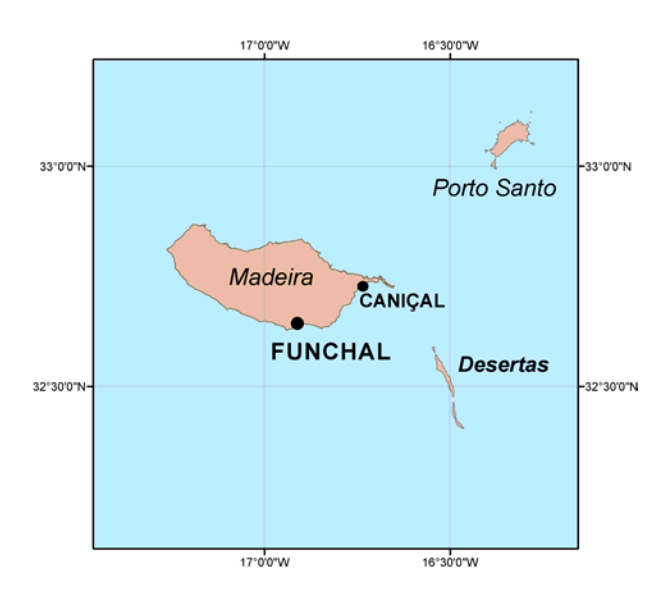
Figure 3 – Main sea level stations in Madeira Archipelago