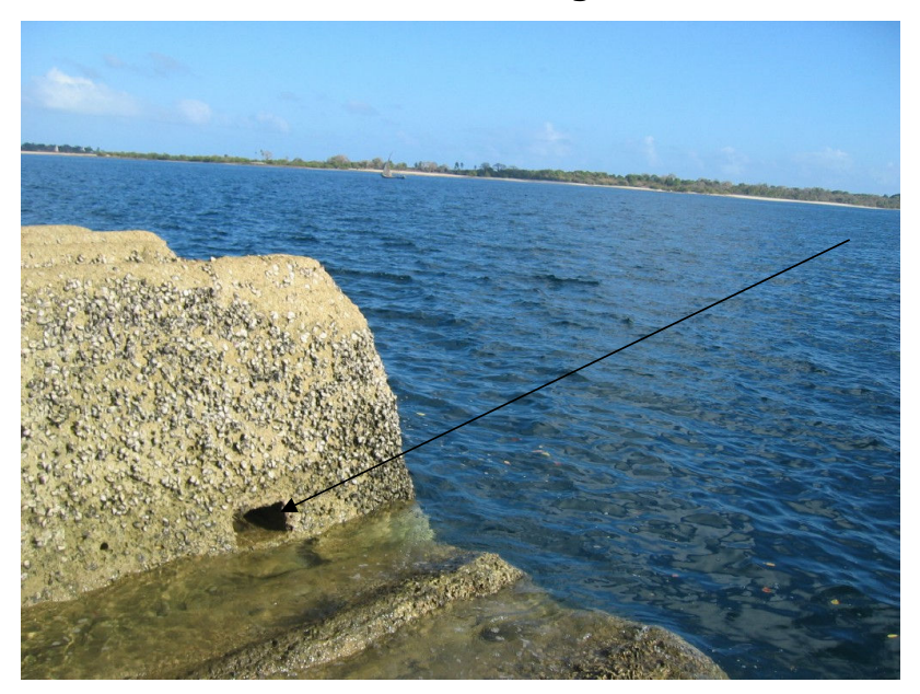
Fig 2: Previous location of the Tide Gauge

Fig 3: Previous location of the Mtwara Tide Gauge