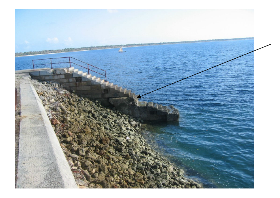
Fig 4: Mtwara Port main quay